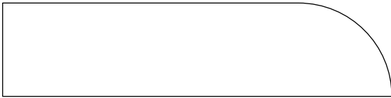
01 BULL NOSING Scale - NTS