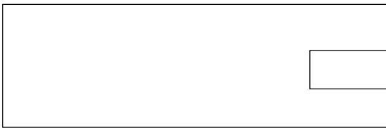
05 TONGUE Scale - NTS